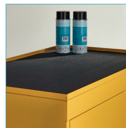
Dished top available on half height cupboard.