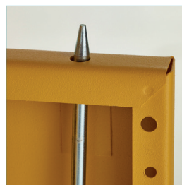
Three points locking for secure storage.